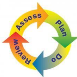
(The Graduated Approach)